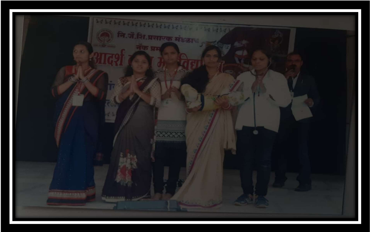
Social drama infanticide is presented by students