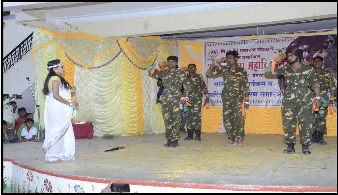
The Deshbhakti Geet of Vande Matram Is being performed in the culture Programme