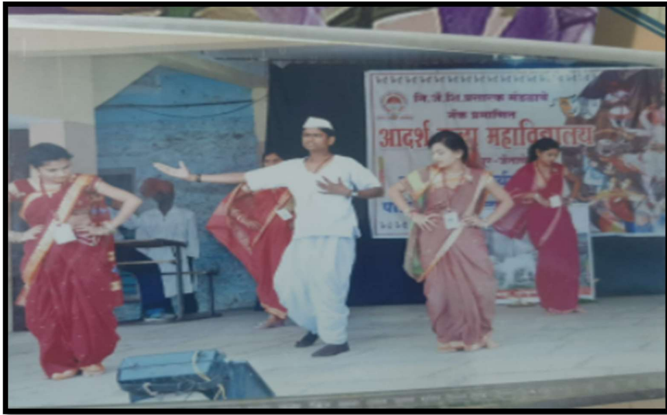
Shetkari Song is being performed by the students