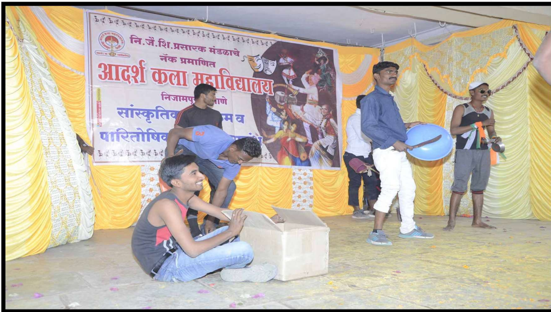
The drama was being performed in the culture programme