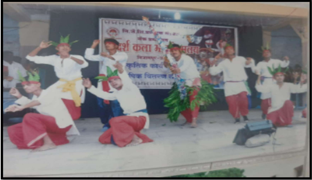
Adiwasi Dance is being performed by the students