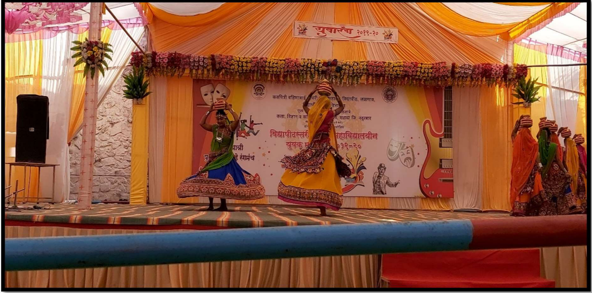
Girls are performing dance in the Yuva Rang