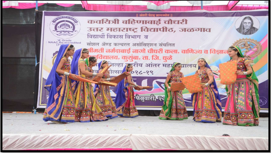
Supada Dance ( Gujrathi ) is being performed by the students