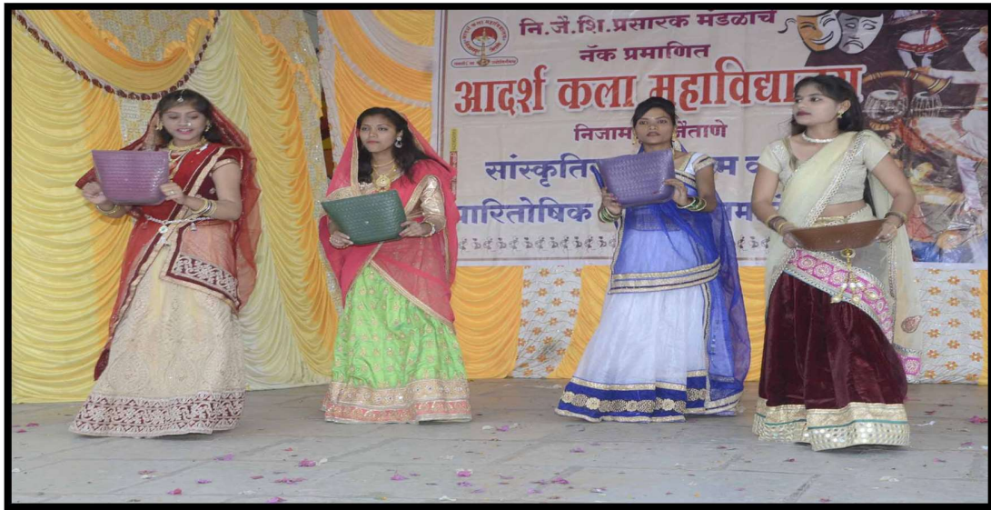
Student of the S.Y.B.A are performing Supada Dance