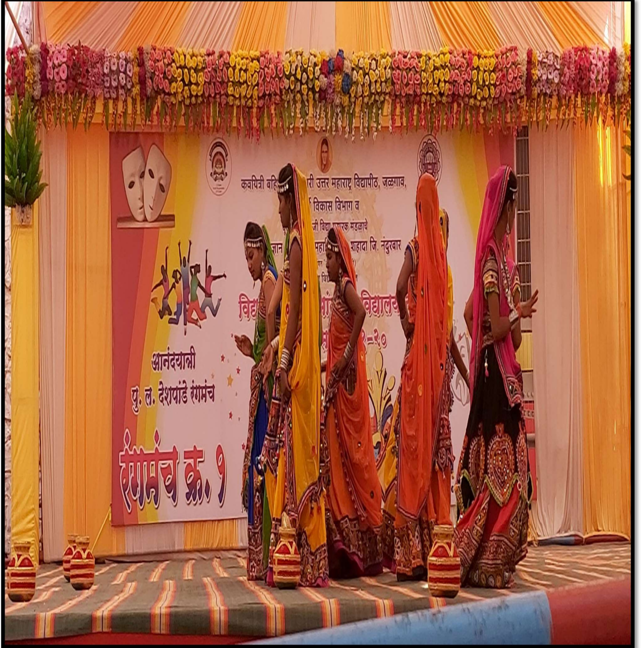
Gujrati Dance by Students