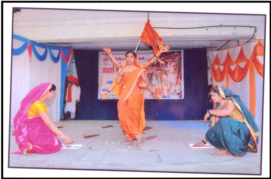
Bhavani Mata Dance Song is being performed by students