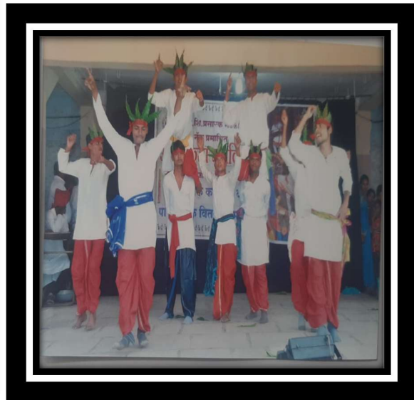
Rodali Dance is being presented