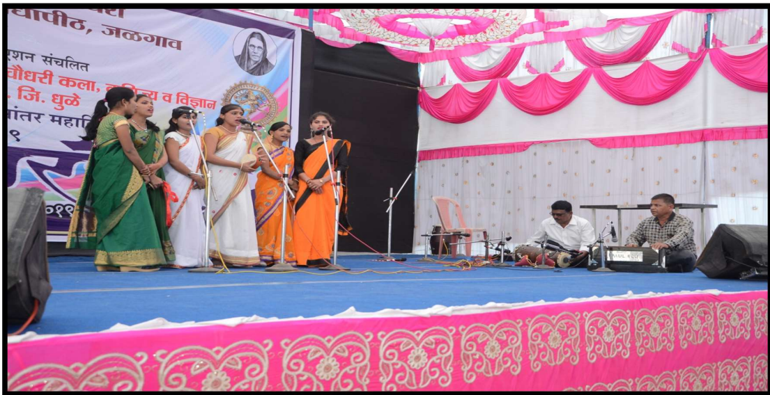
Students are performing Group Song in the Yuva rang