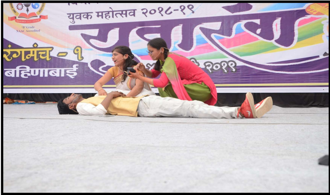
Students are performing the skit in the yuvarang 2018-19