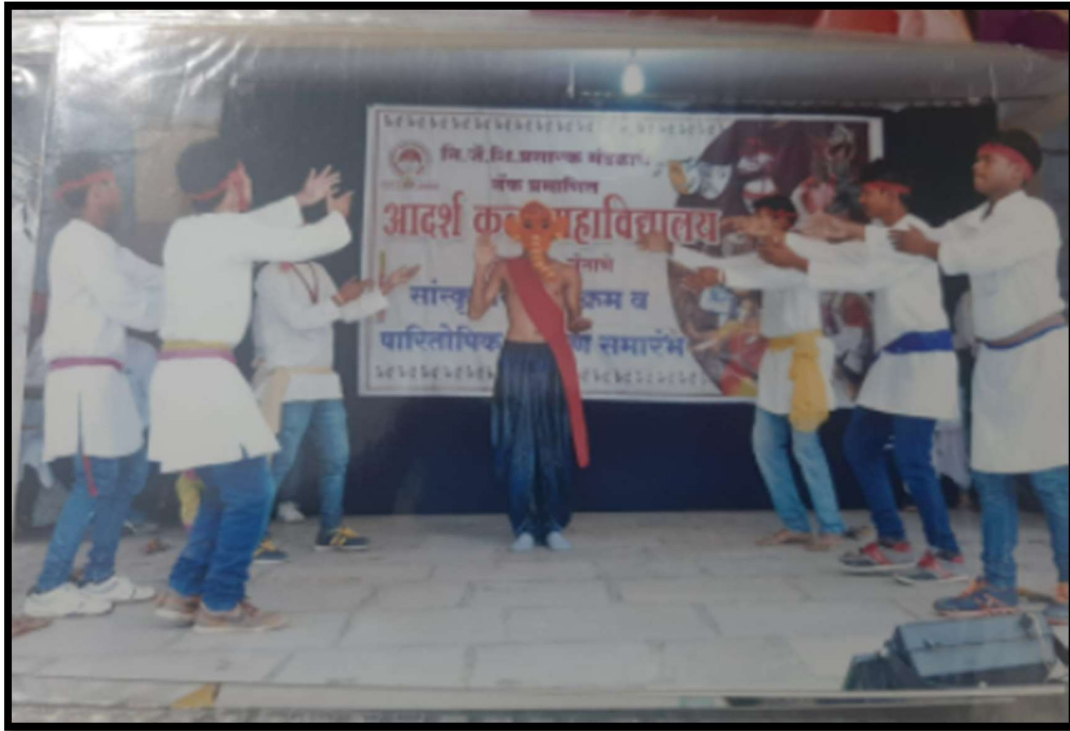
Ganesh Arti is being Performing by studnts