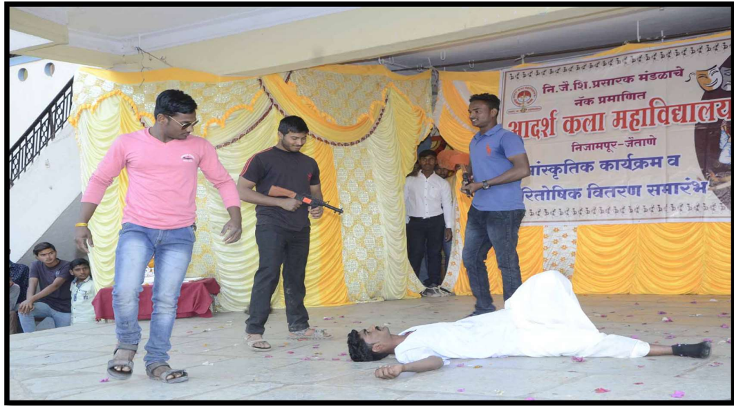
The scene of the Drama on Farmer is in the culture drama