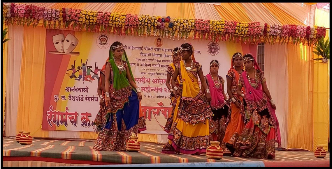
Dance of the girls on the stage