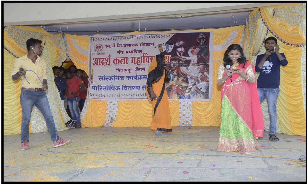
The Educational Drama of Mobile craziness' is being performed in the programme