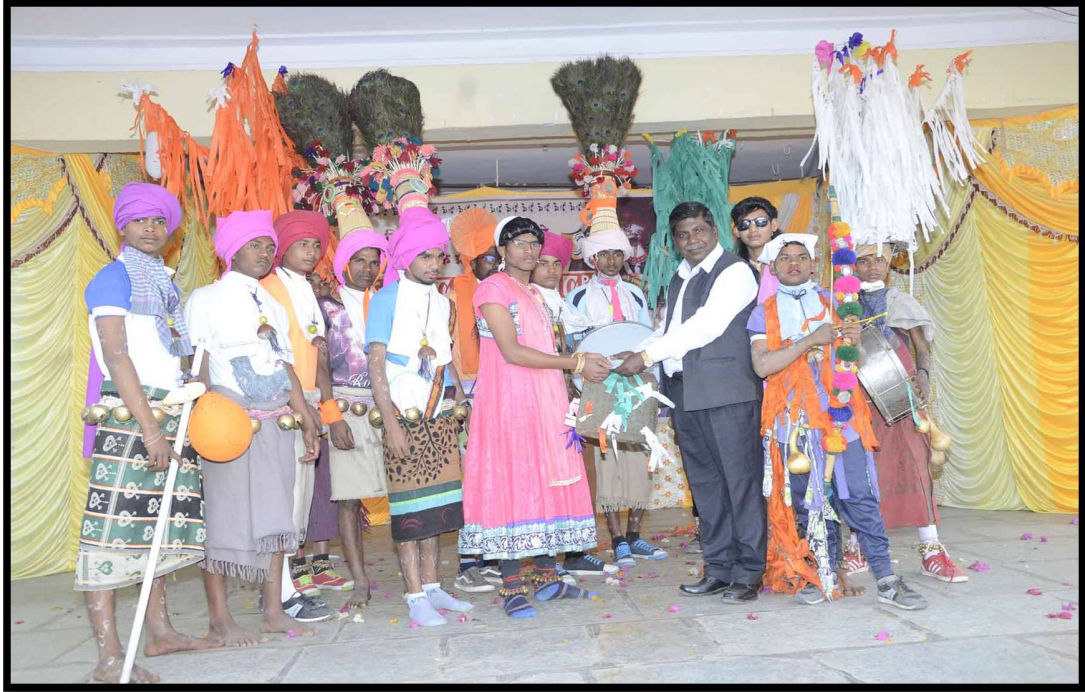
The Tribal students of the college are being awarded in the culture programme