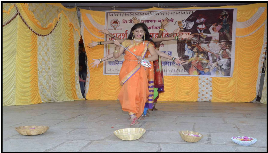
Devi Mata Song is being performed by the students