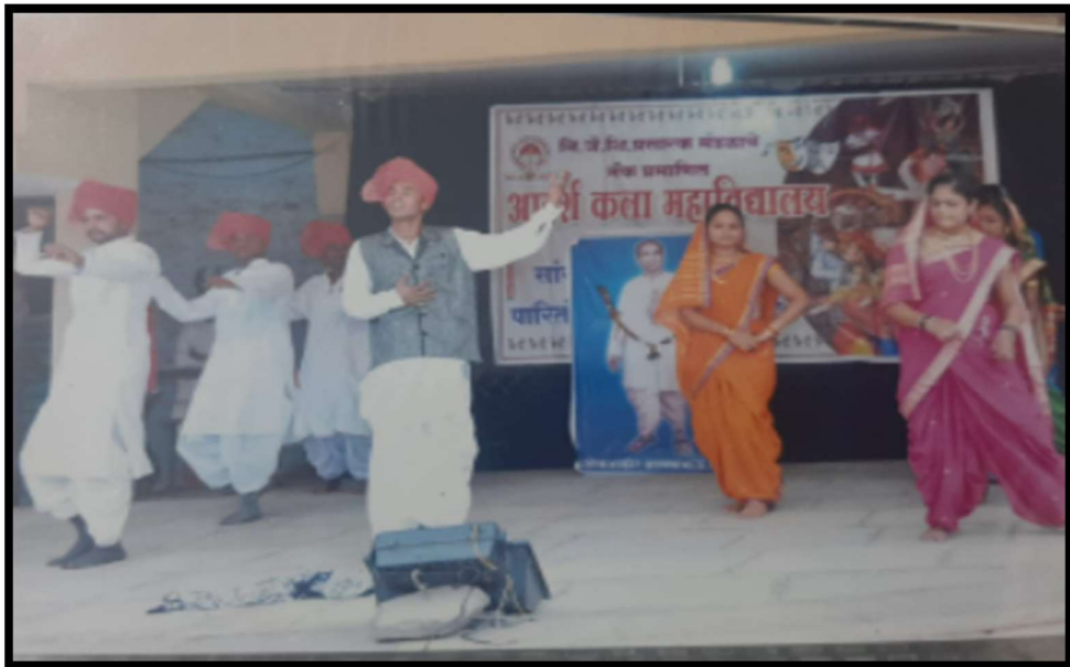
Powala is being performed by the students