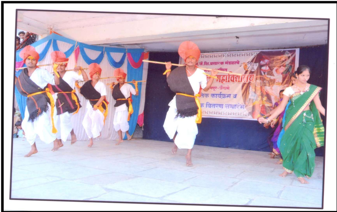
Dhanagar Vyadyat Ghusala Group Dance