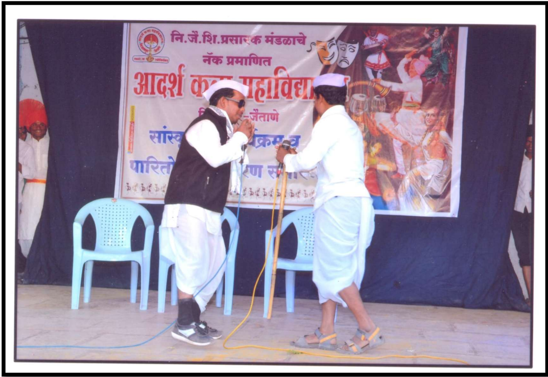
Comedy Drama was being performed by the students