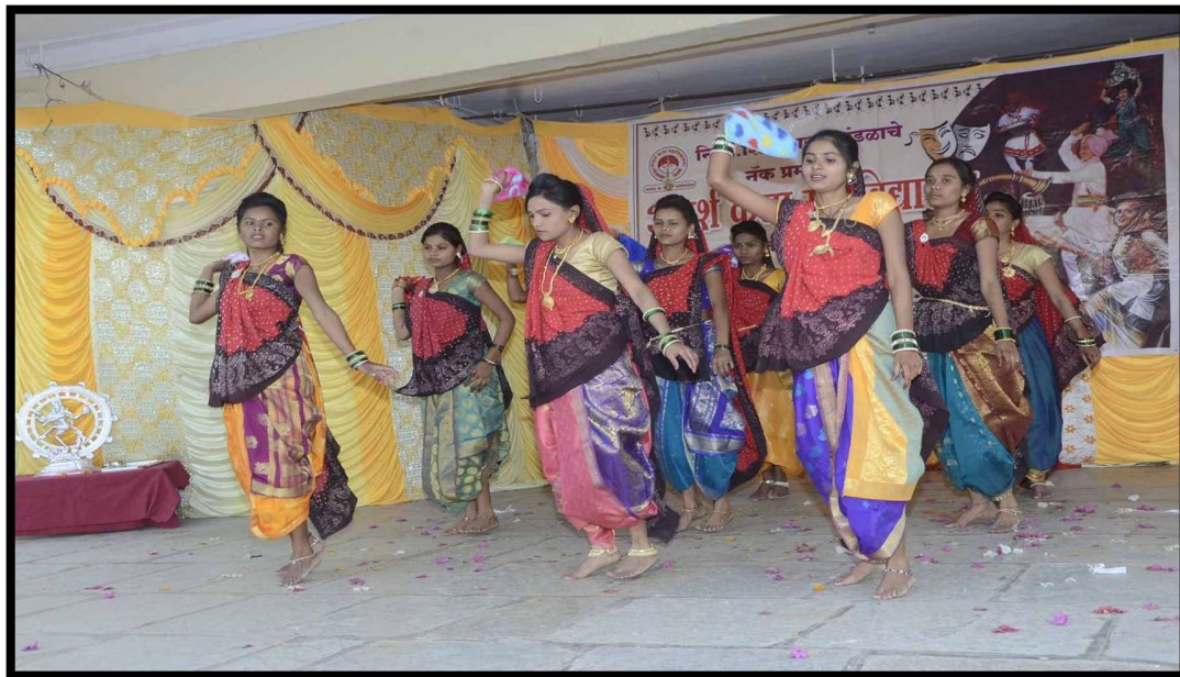
The Tribal girls students are performing Pawari in the culture programme