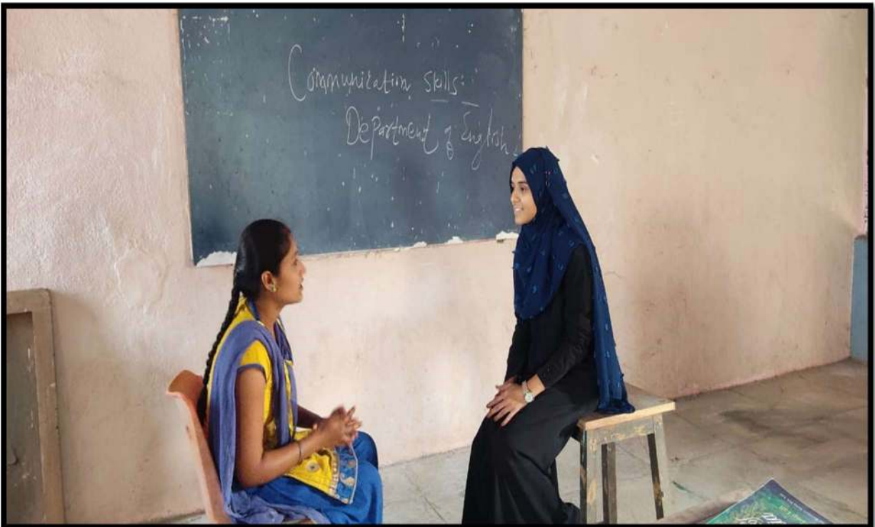
Students are discussion with friends in the class