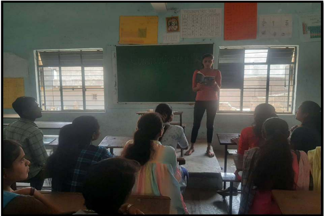
Student is practicing speaking English in the course