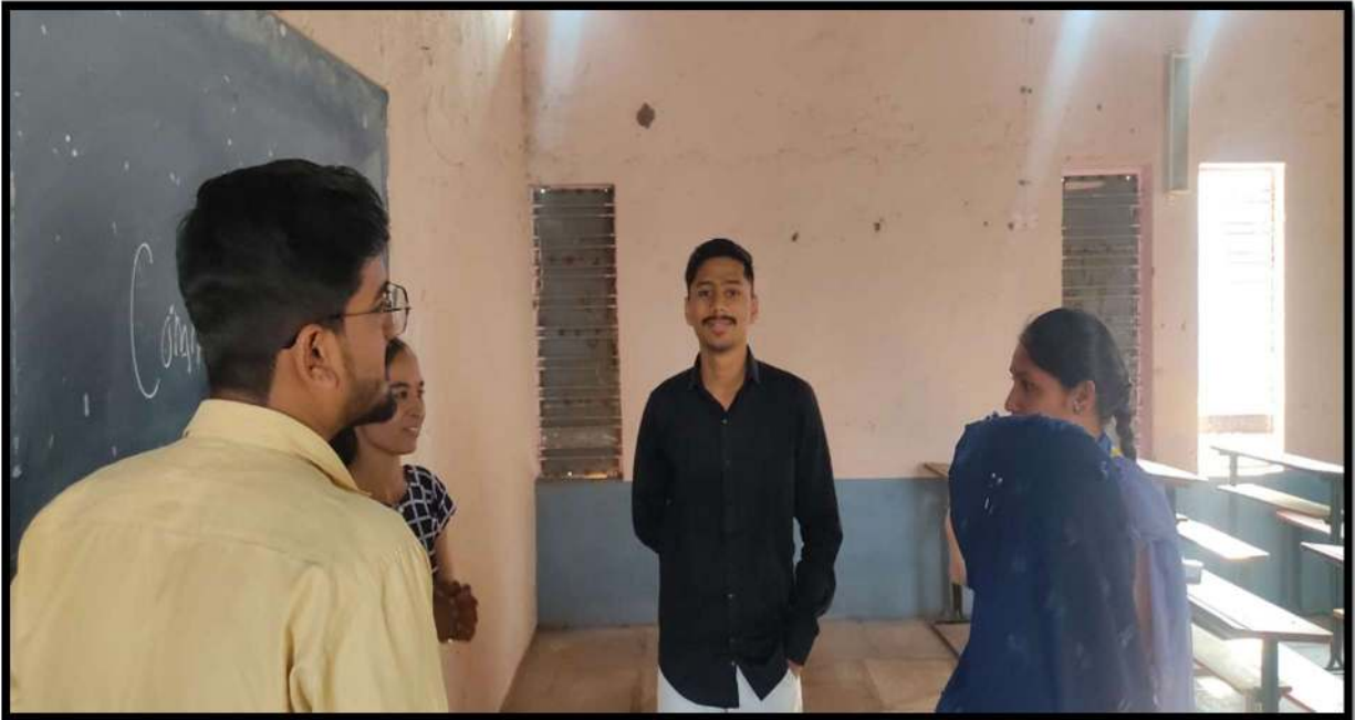
Students are interacting with group wise in the class