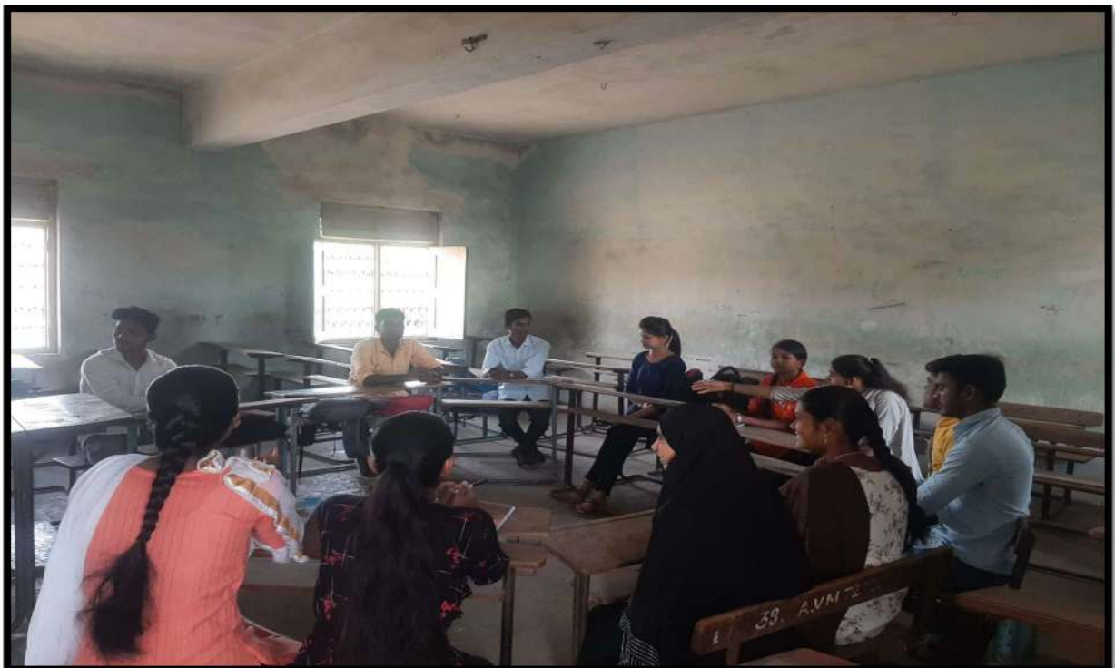
Students are in the group discussion activity