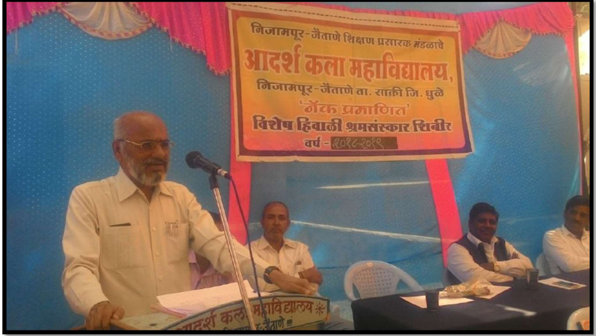
Valedictory function of NSS camp