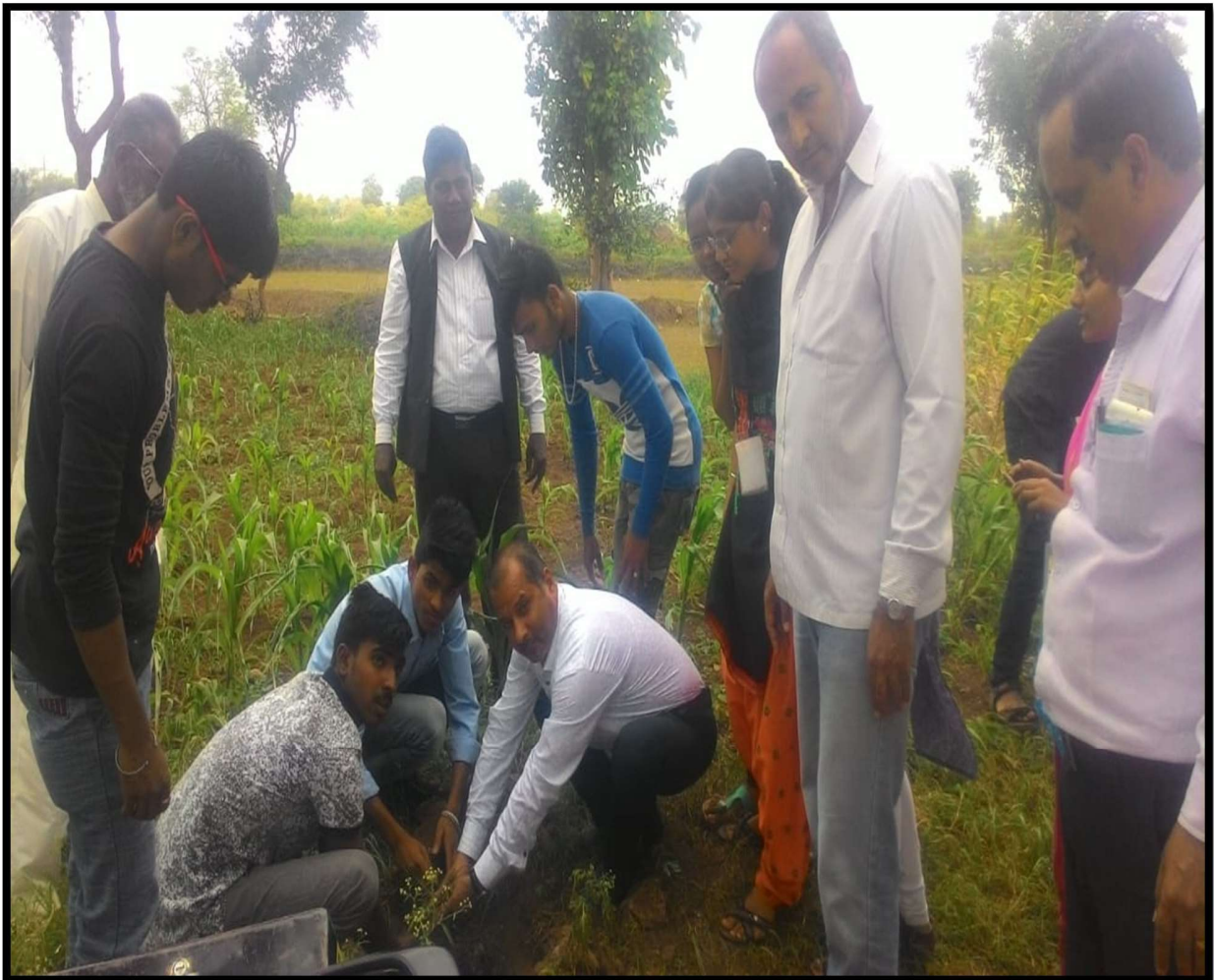
Student Volunteers and staff members while planting a tree