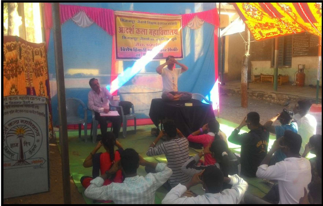
Resource Person demonstrate Yogasan