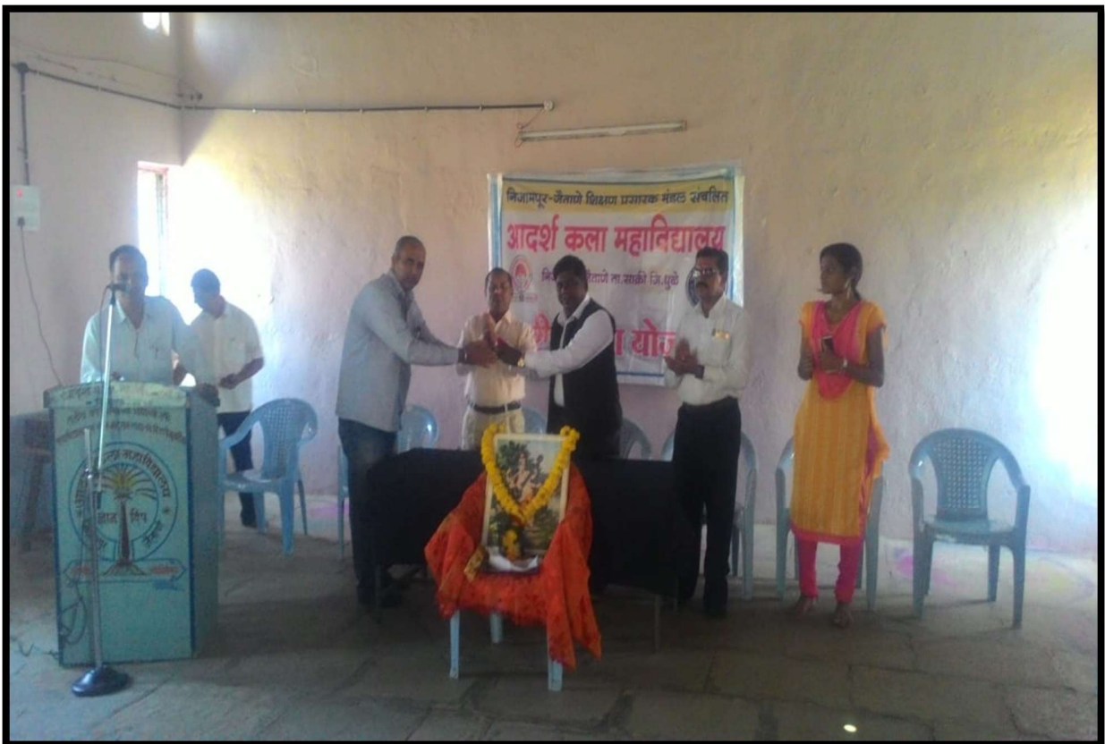
NSS day function