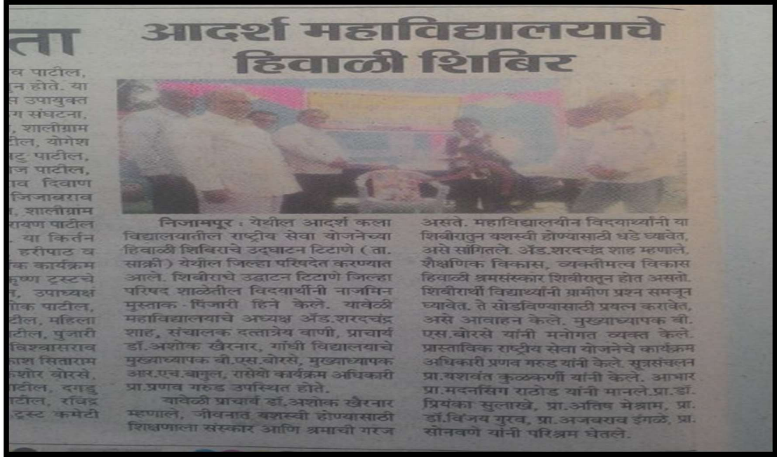
Media Coverage of NSS Camp