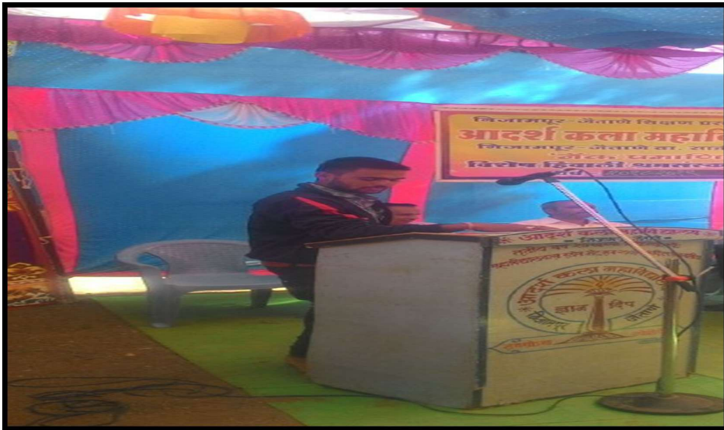
Student present related topic