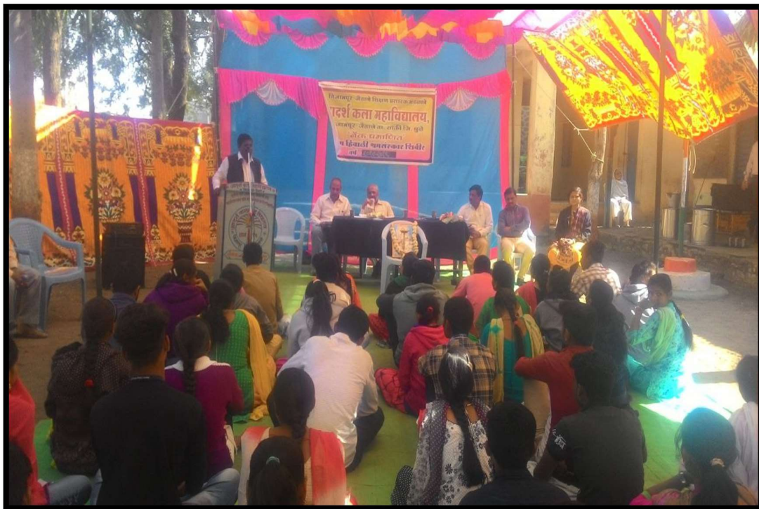
Opening Ceremony of NSS Camp