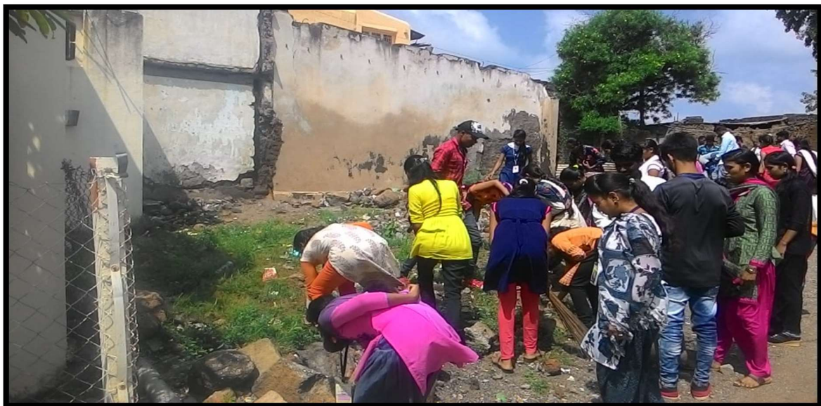
Students in campus cleaning drive

Adarsh college of Arts NSS Unit participated in cleanliness Drive for Republic day on 26 January 2019. 50 student volunteers were part of this Programme campus cleaning activity and marking of the ground for flag hosting was carried out by student volunteers after which the participated in flag hosting function. officer Pranav Garud and assistant programme officer Y.R.Kulkarni work for the success of this programme.