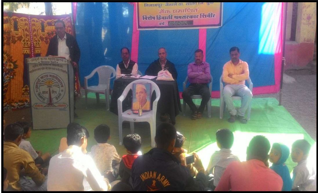
Celebrating Sane Guruji Jayanti