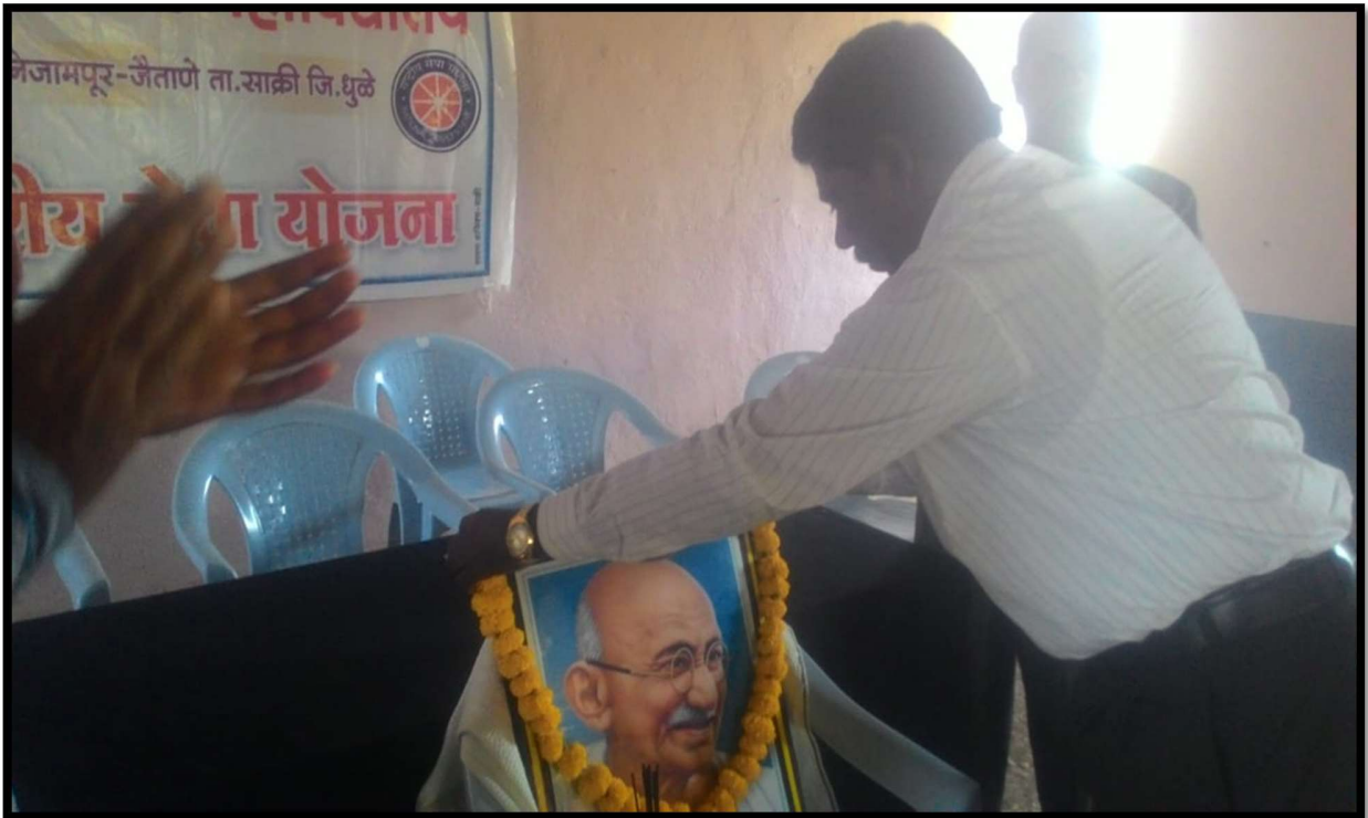
Pratima Pujan of Mahatma Gandhi on Ahinsa Din