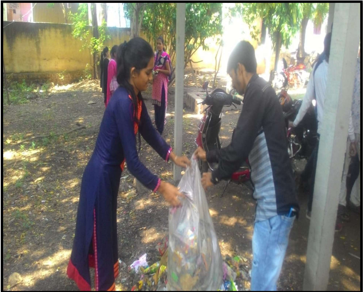
Students working in campus cleaning