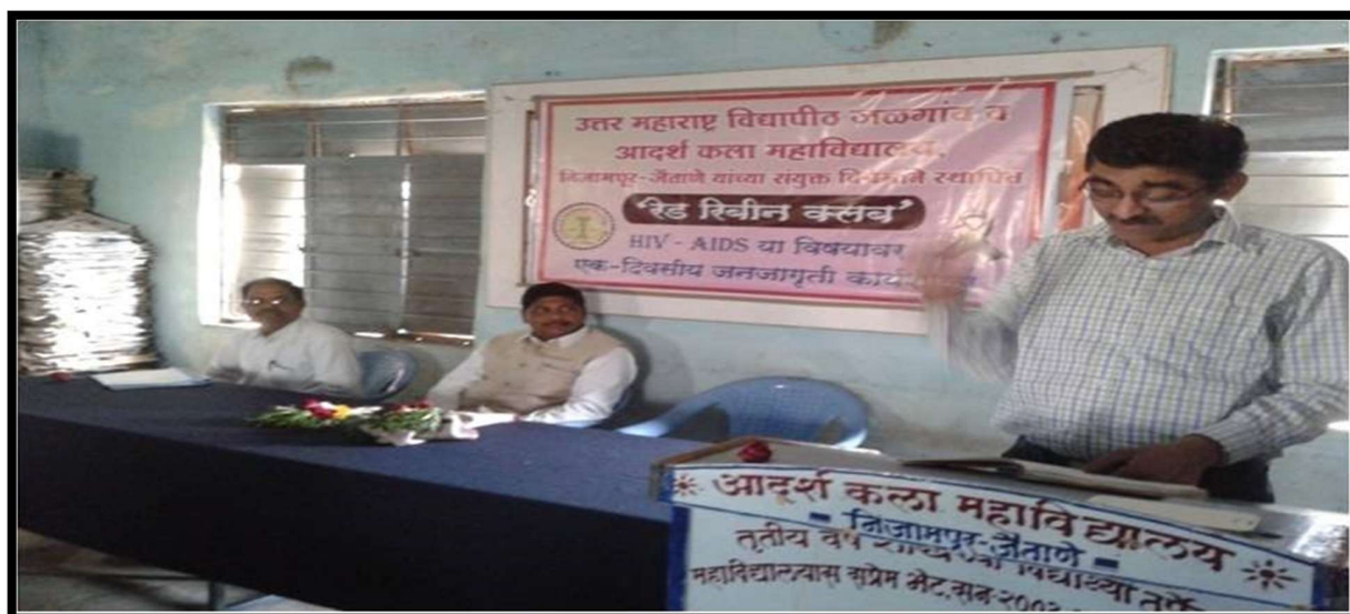
Lecture on Blood Donation and AIDS Awareness