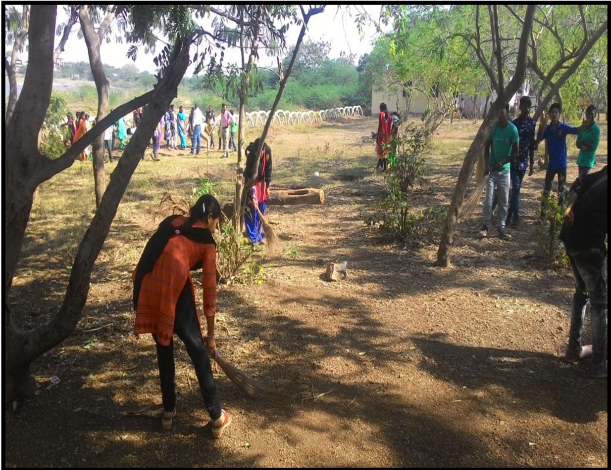
Student participated in cleaning drive

Pre Independence day campus cleaning Programme was conducted on 14 th August 2018. student volunteers cleaned the college campus and college ground on which flag hosting was to be perform on next day morning they marked the ground for flag hosting ceremony and helped in other preparation of independence day celebration 40 student volunteers participated in this campus cleaning drive Programme officer Pranav Garud and assistant programme officer work for the success of this programme