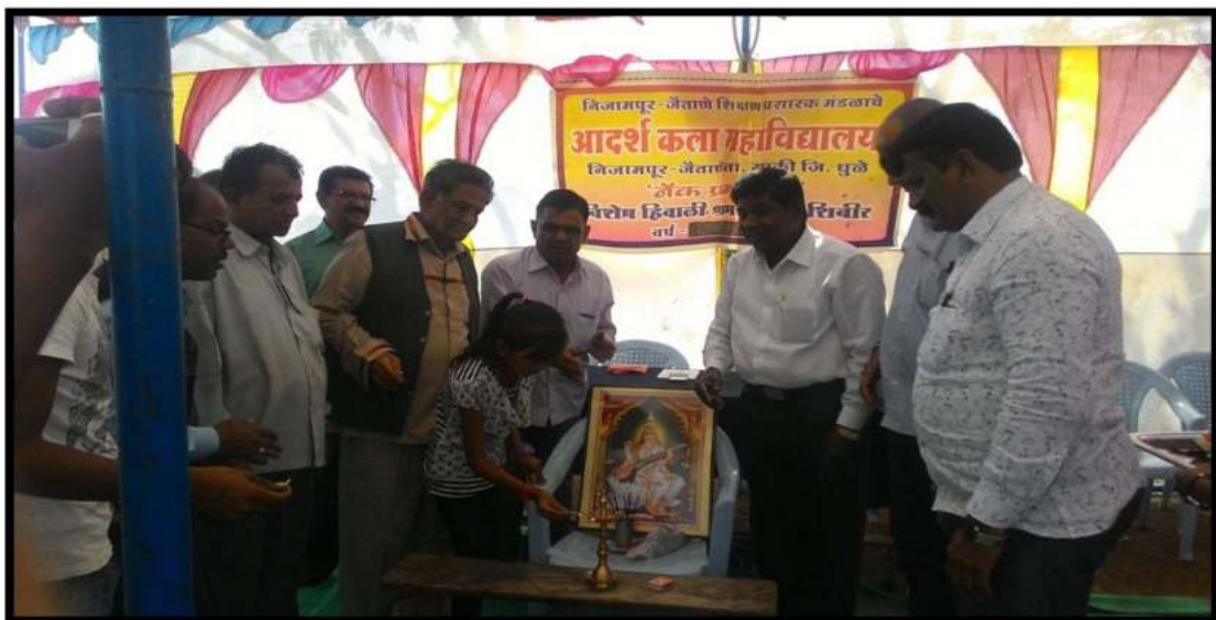
Opening ceremony of NSS Camp