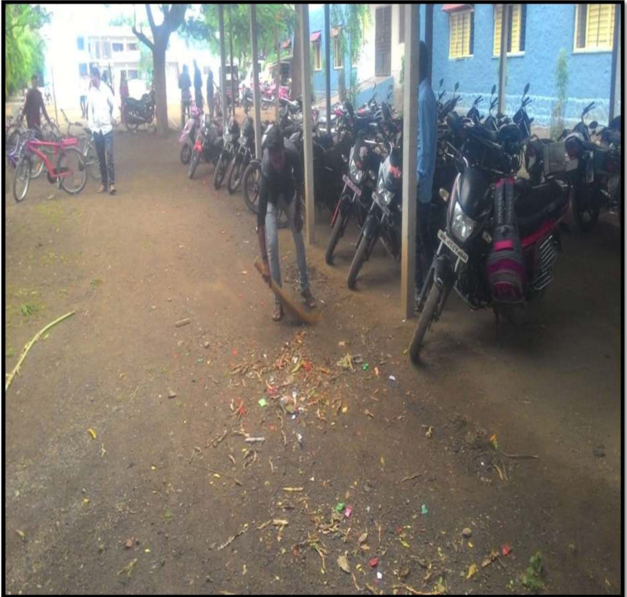
Ahimsa din campus cleaning