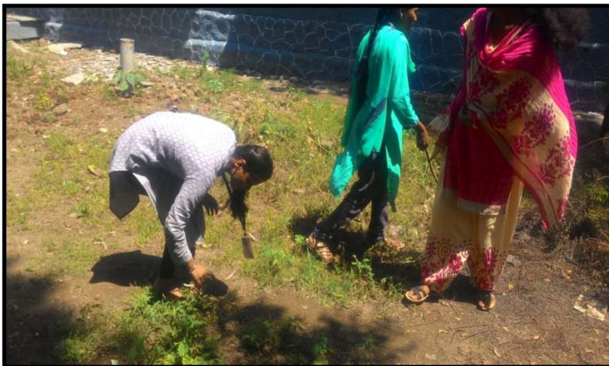
NSS student Volunteers in campus cleaning activity

Pre Independence day campus cleaning Programme was conducted on 14 th August 2017 student volunteers cleaning the college campus the college ground on which flag hosting was to be perform on next day morning the marked the ground for flag hosting ceremony and helped in other preparation of independent day celebration 50 student volunteers participated in this campus cleaning drive Programme officer Pranav Garud and assistant programme officer work for the success of this programme