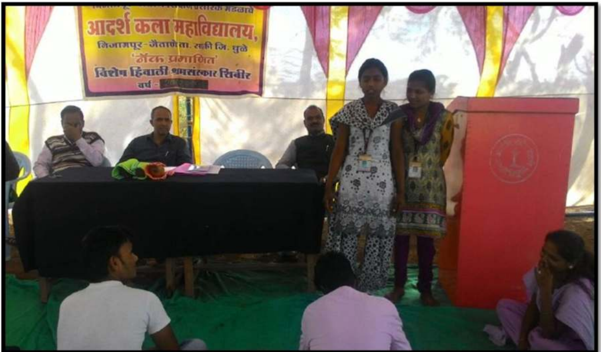
Songs presented by NSS student Volunteers