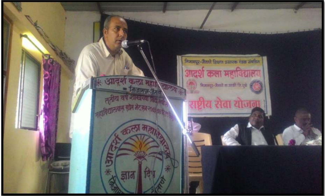
NSS day function