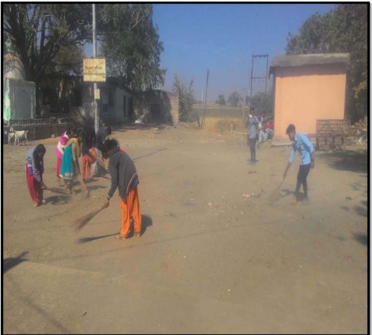
Students in Hutatma din cleaning drive