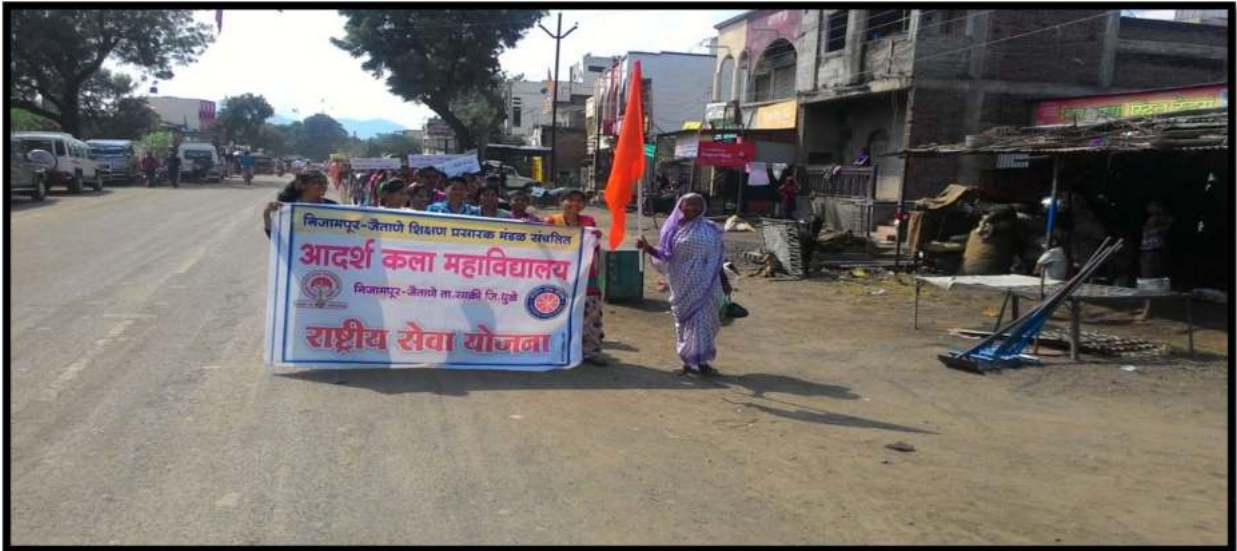
Beti Bachao Beti Padhao Rally in Nijampur Jaitane