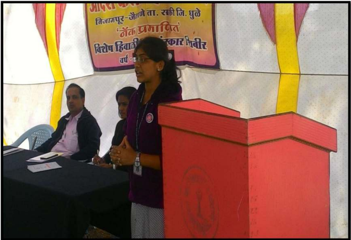
Student Volunteer giving presentation on related topics