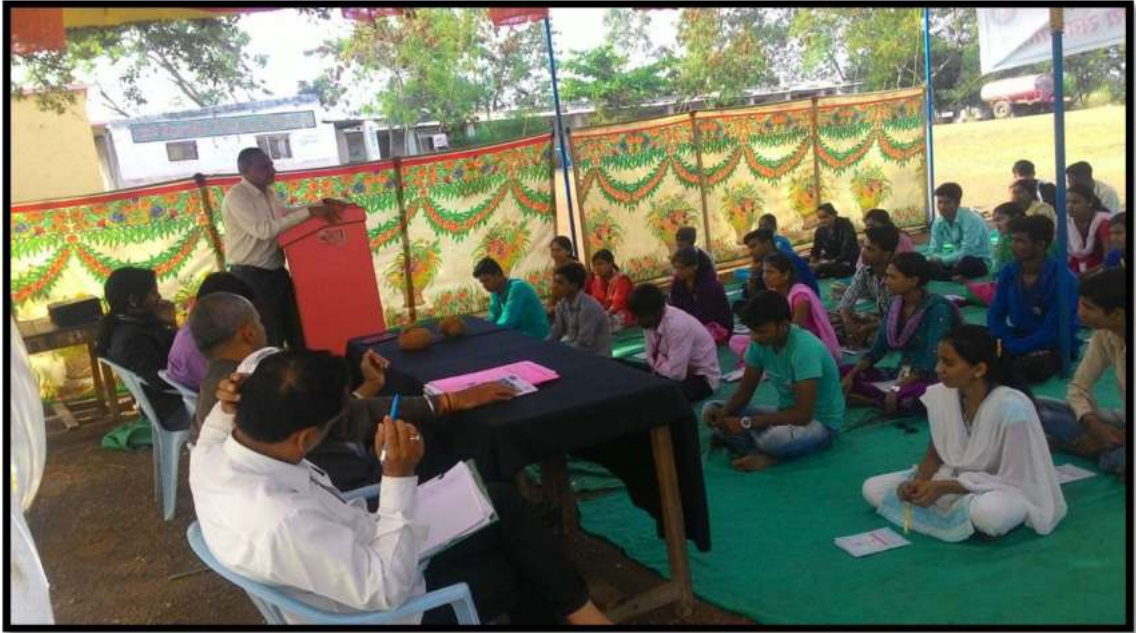
Resource person guided the students in NSS camp