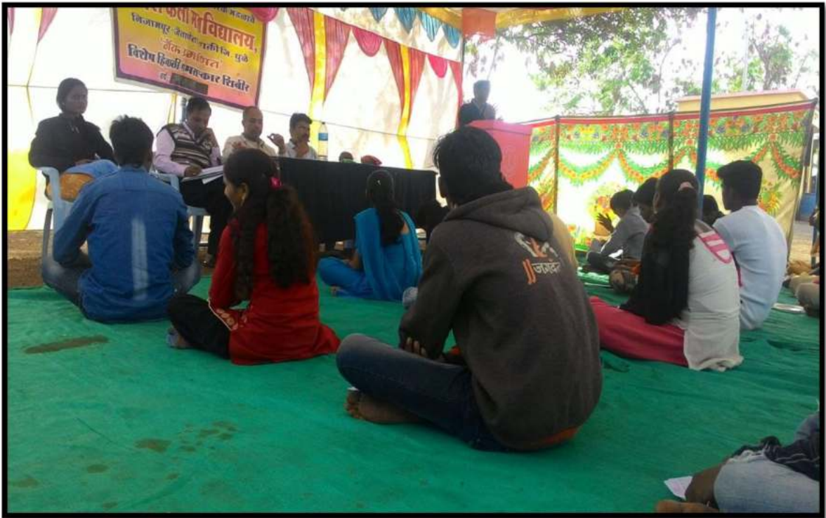
Resource person guided the students in NSS camp