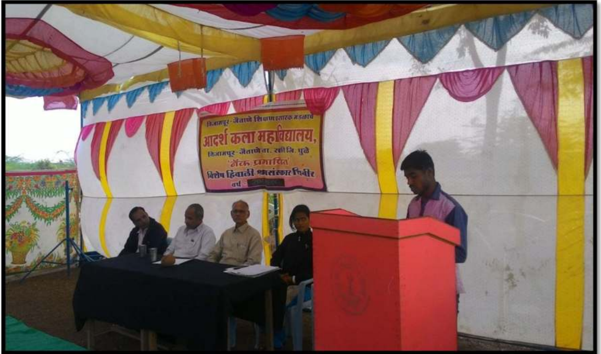
Seminar presentation on related topic