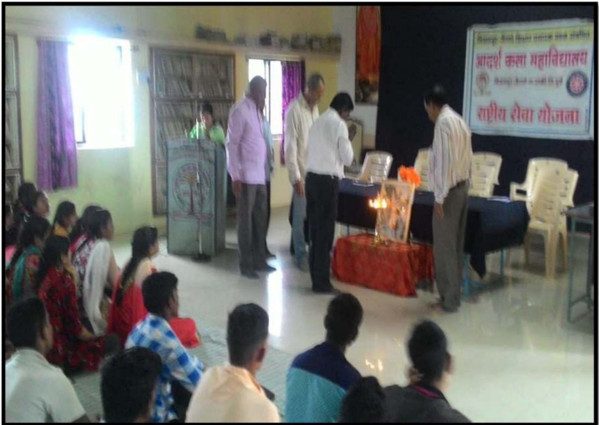
Lightening the lamp at NSS opening Programme