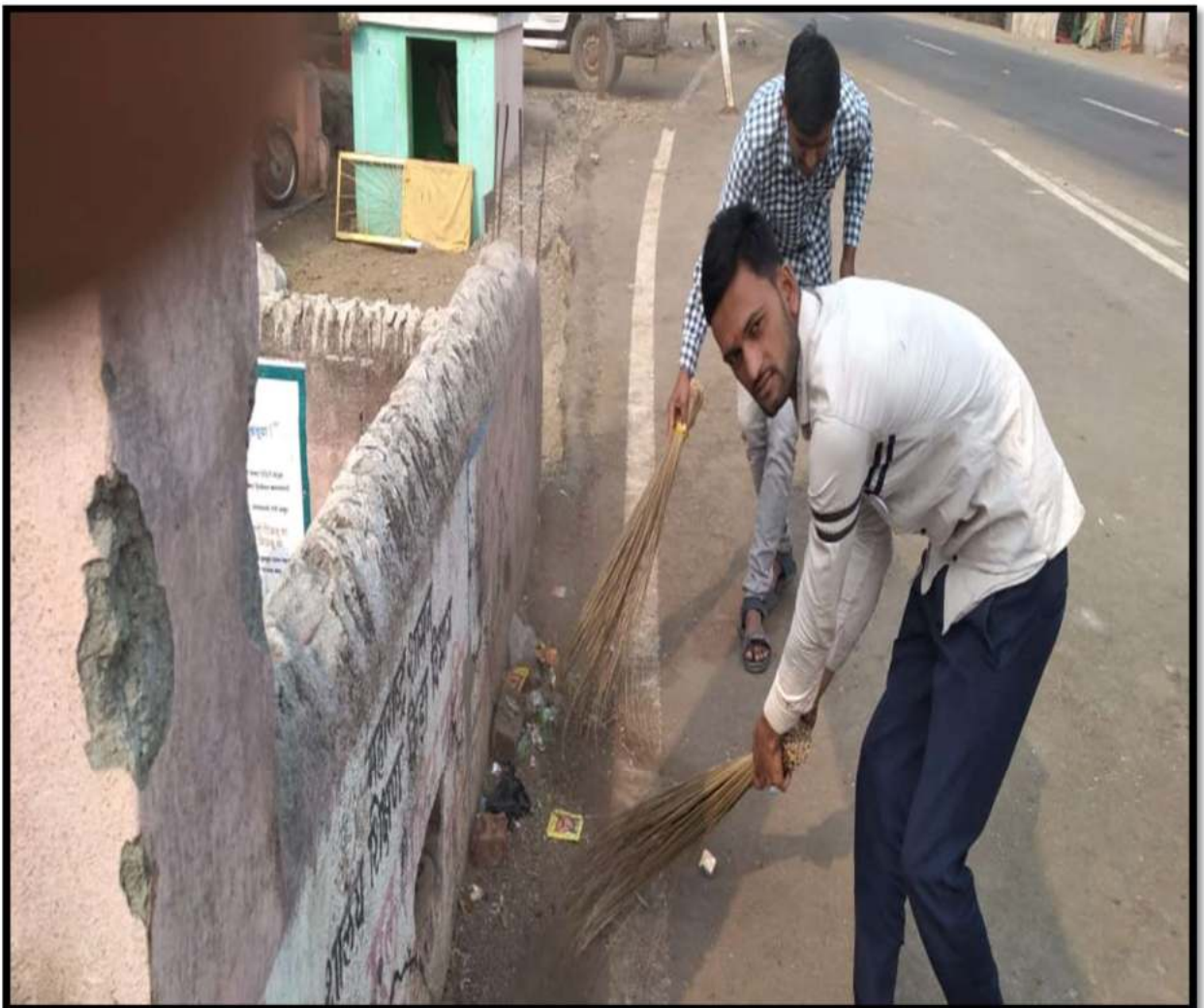
Students in campus cleaning drive

Adarsh college of Arts NSS Unit participated in cleanliness Drive for Republic day on 26 January 2018. 50 student volunteers were part of this Programme campus cleaning activity and marking of the ground for flag hosting was carried out by student volunteers after which the participated in flag hosting function. Officer Pranav Garud and assistant programme officer work for the success of this programme.