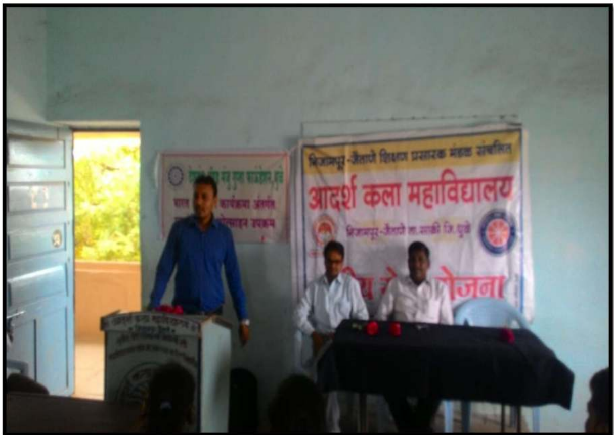
Workshop on Employment oriented course by Manju Gupta Foundation