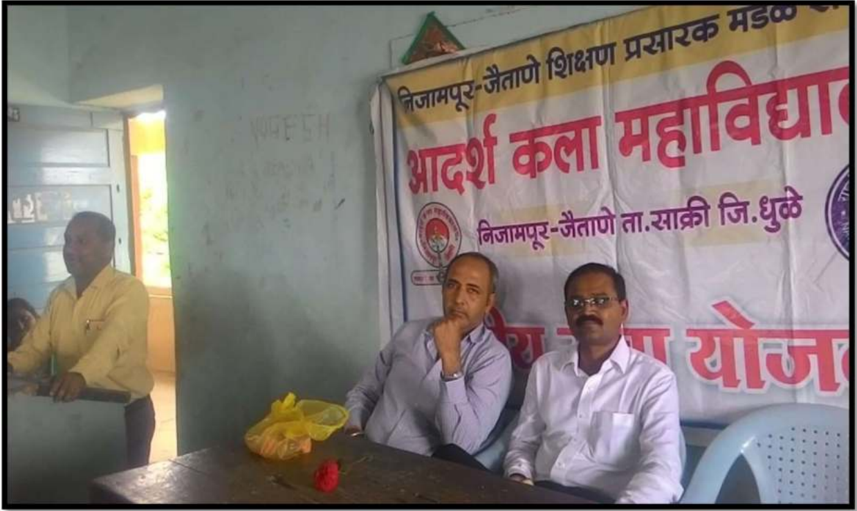
Hindi Din function