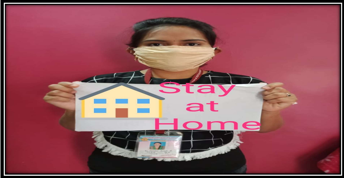
Message of Stay at Home during COVID-19