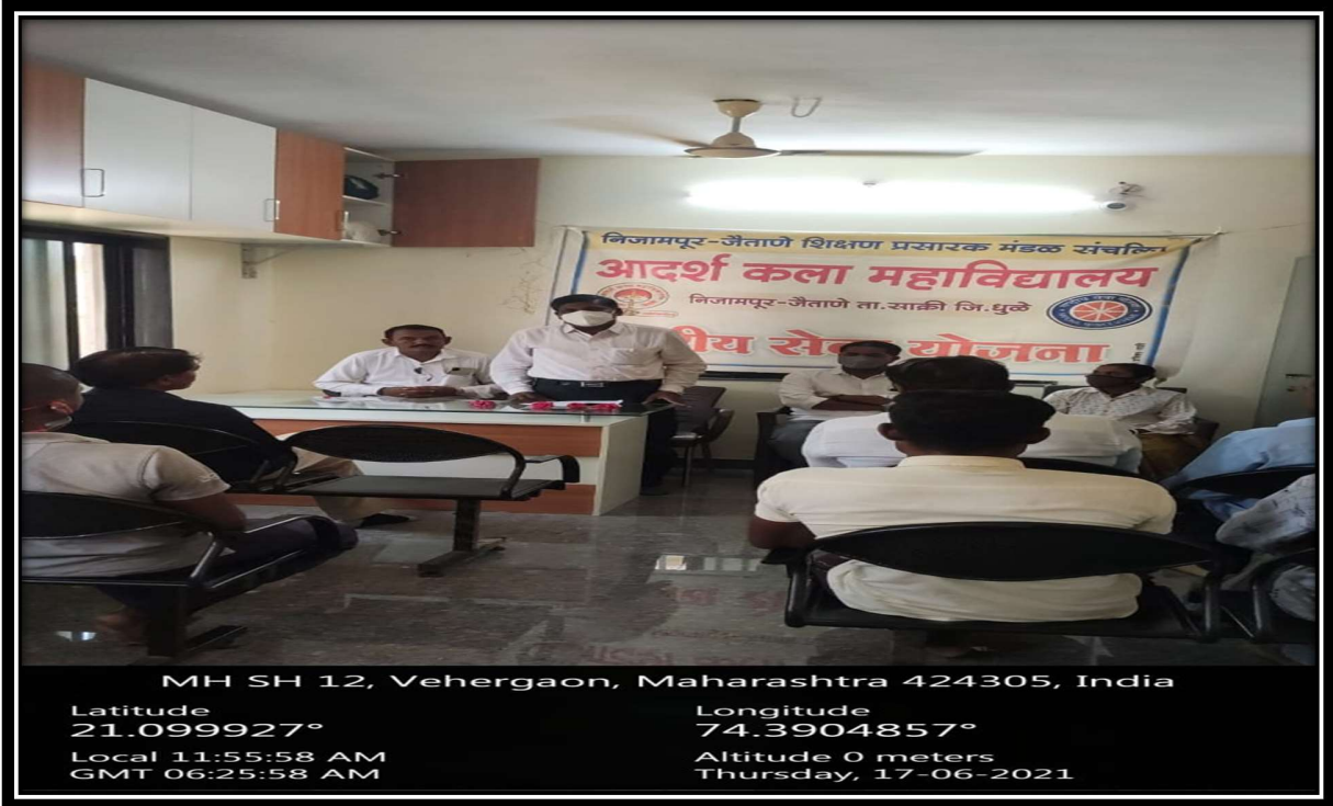
Awareness Camp on COVID-19 at Waghapur