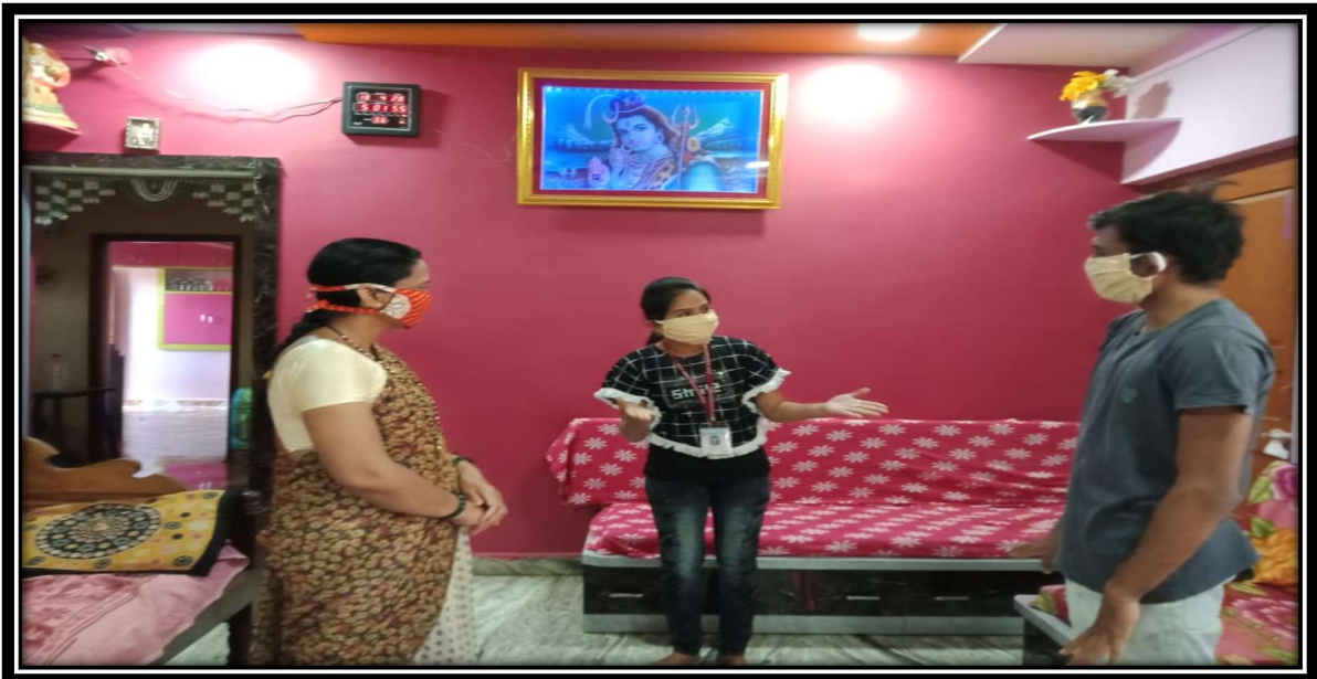
Student told about COVID-19 Precaution to citizens of society