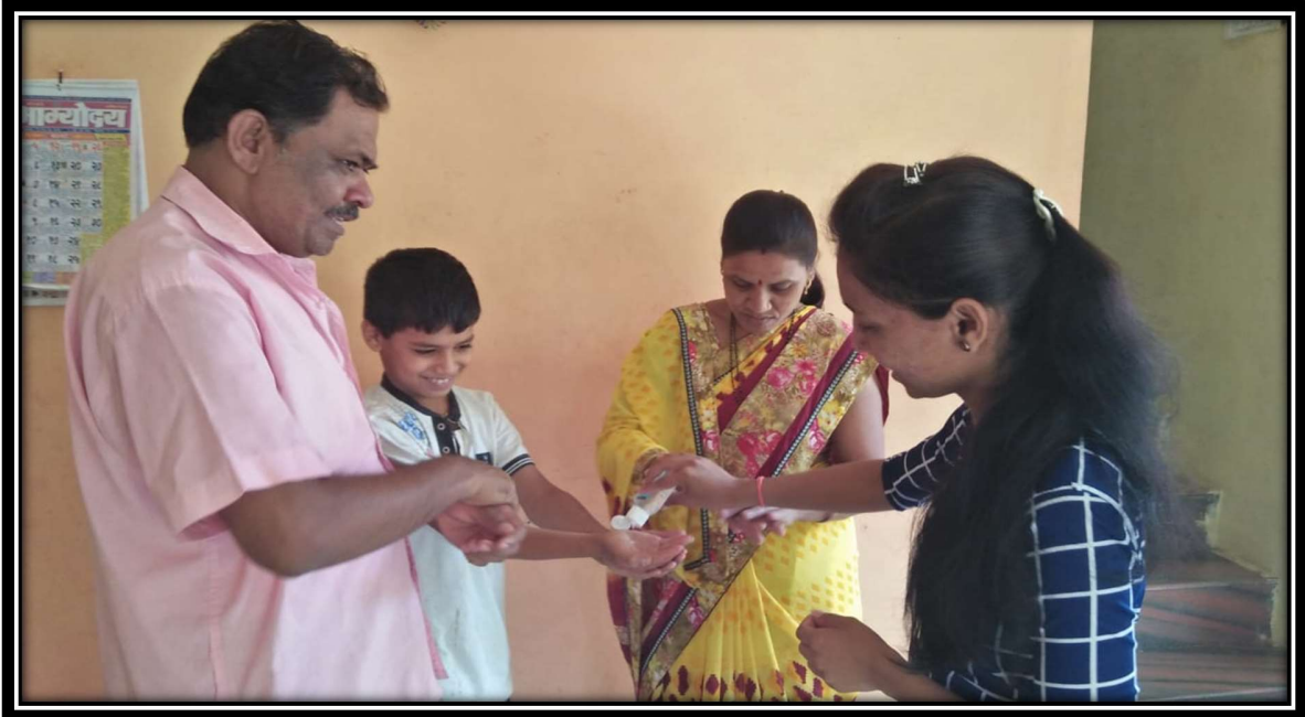
Frequently Use of Soap and Alcohol Based Sanitizer