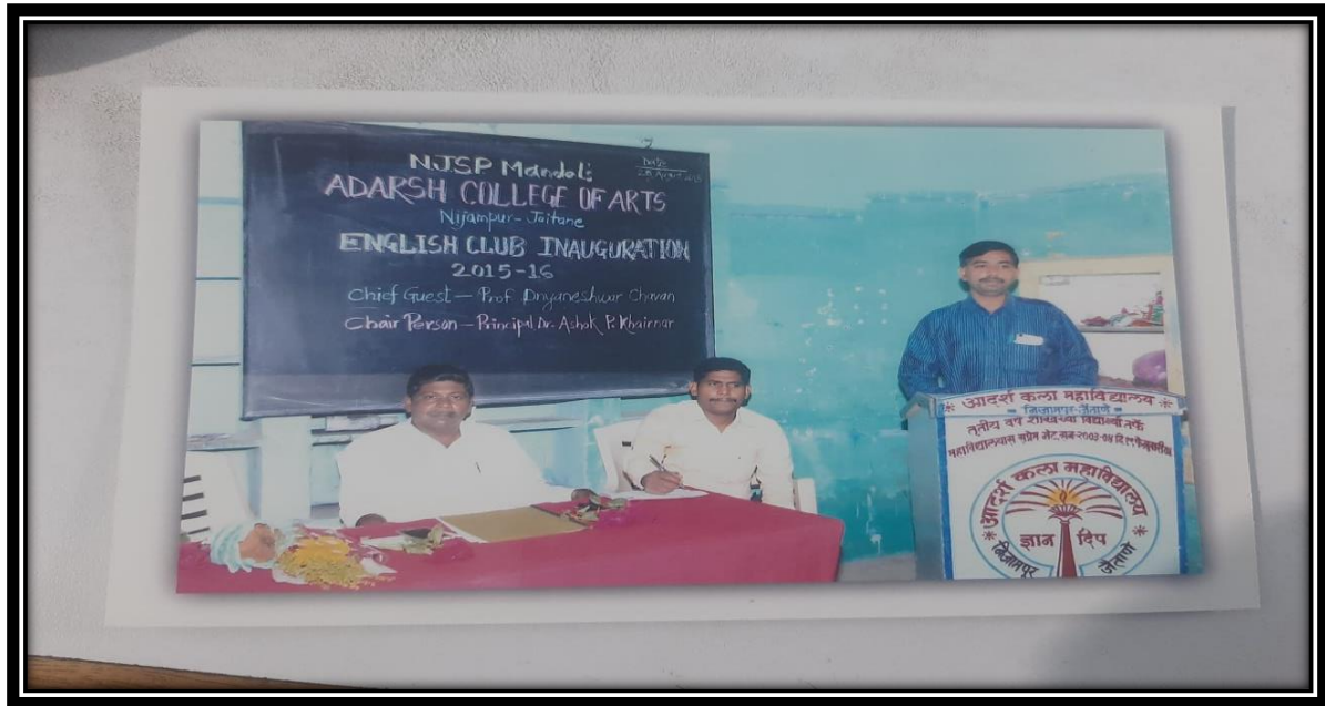
Organized Programme by English Club