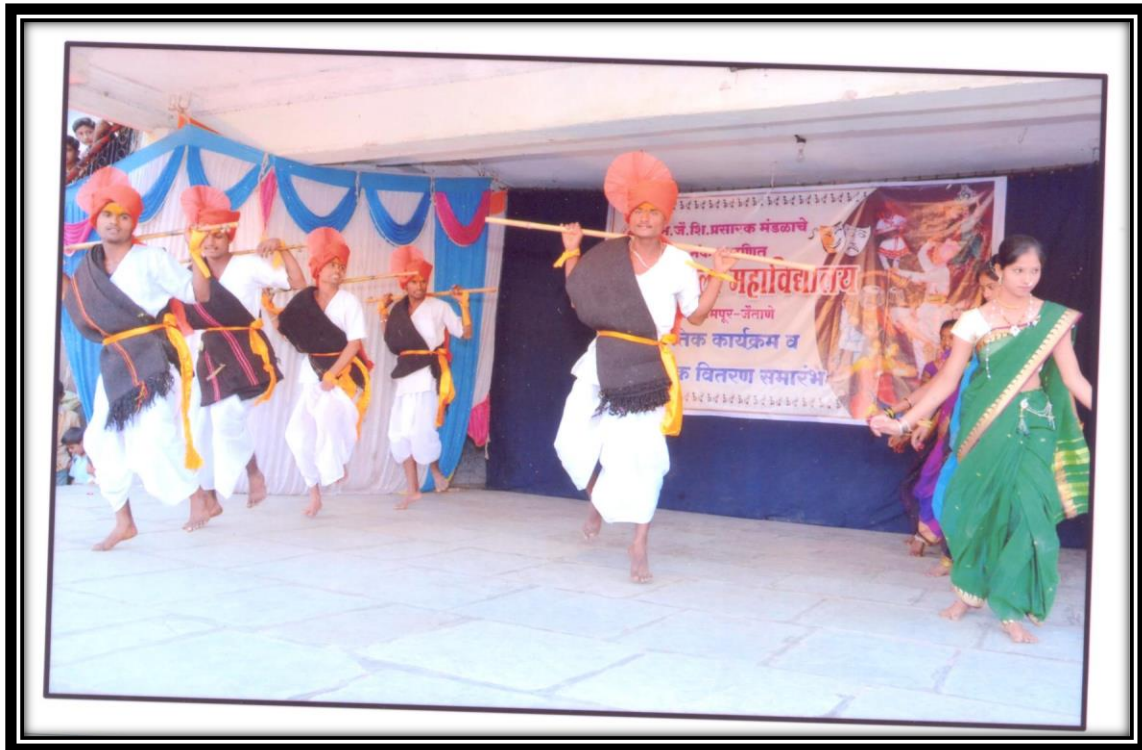
Performance of Students in Cultural Programme