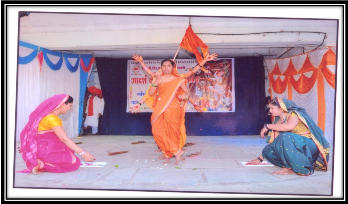
Performance of Students in Cultural Programme