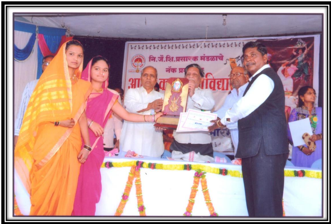
Students carried prize and certificate on the occasion of cultural programme