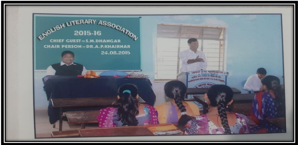
Organized Programme on Literature by English Literary Association