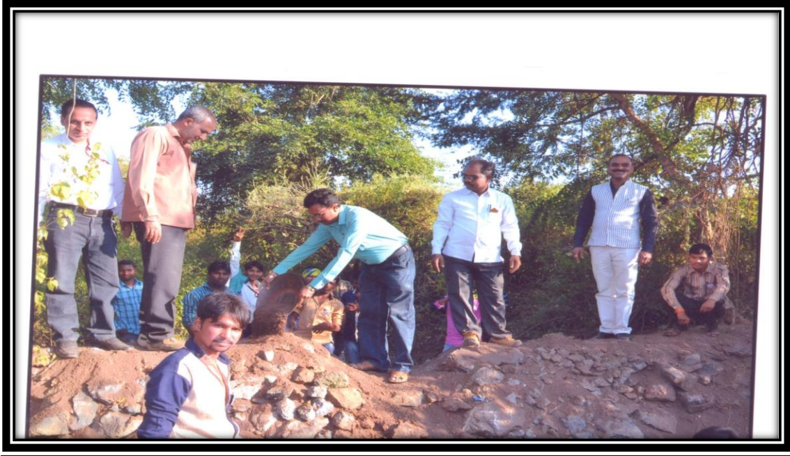
Workout in NSS Camp by the Students and Teachers