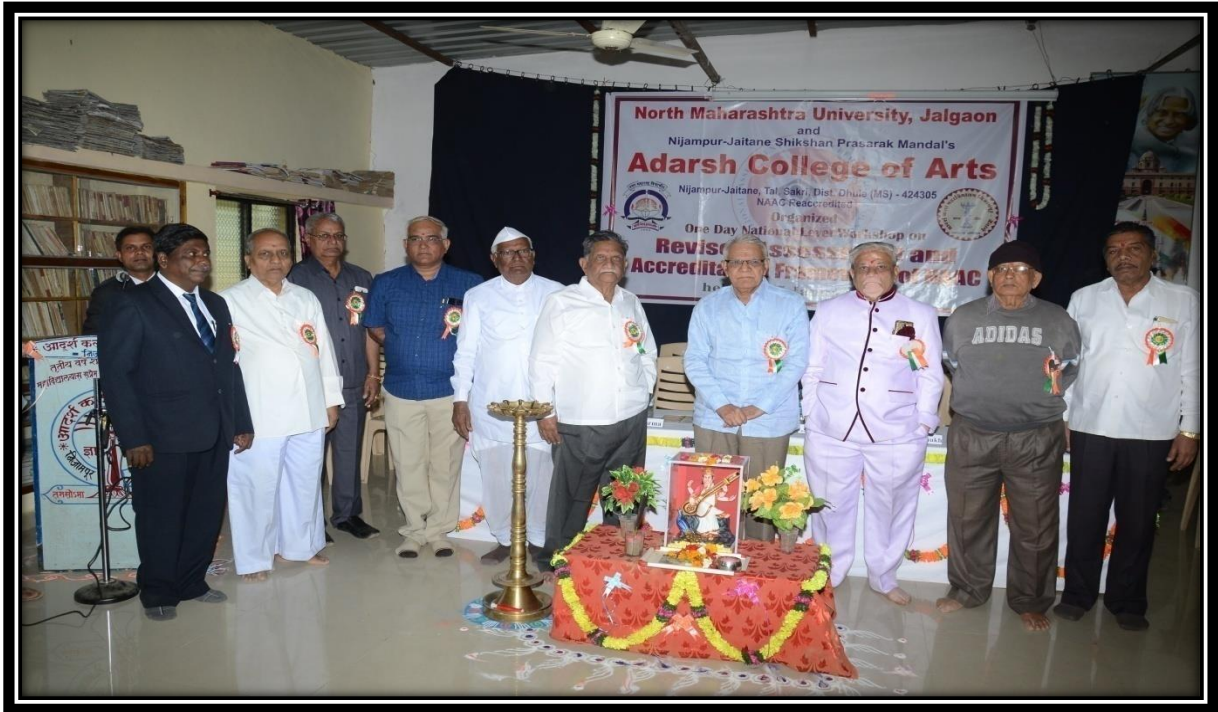
Inaugural Function of National Level Workshop