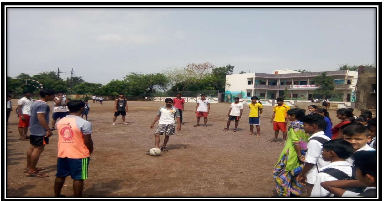
Students playing Football in College Ground