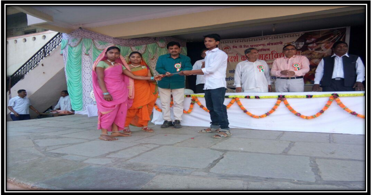
Students carried prize and certificate on the occasion of cultural programme