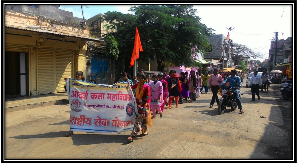
Organized Rally on Beti Bachhav Beti Padav in Nijampur-Jaitane Village