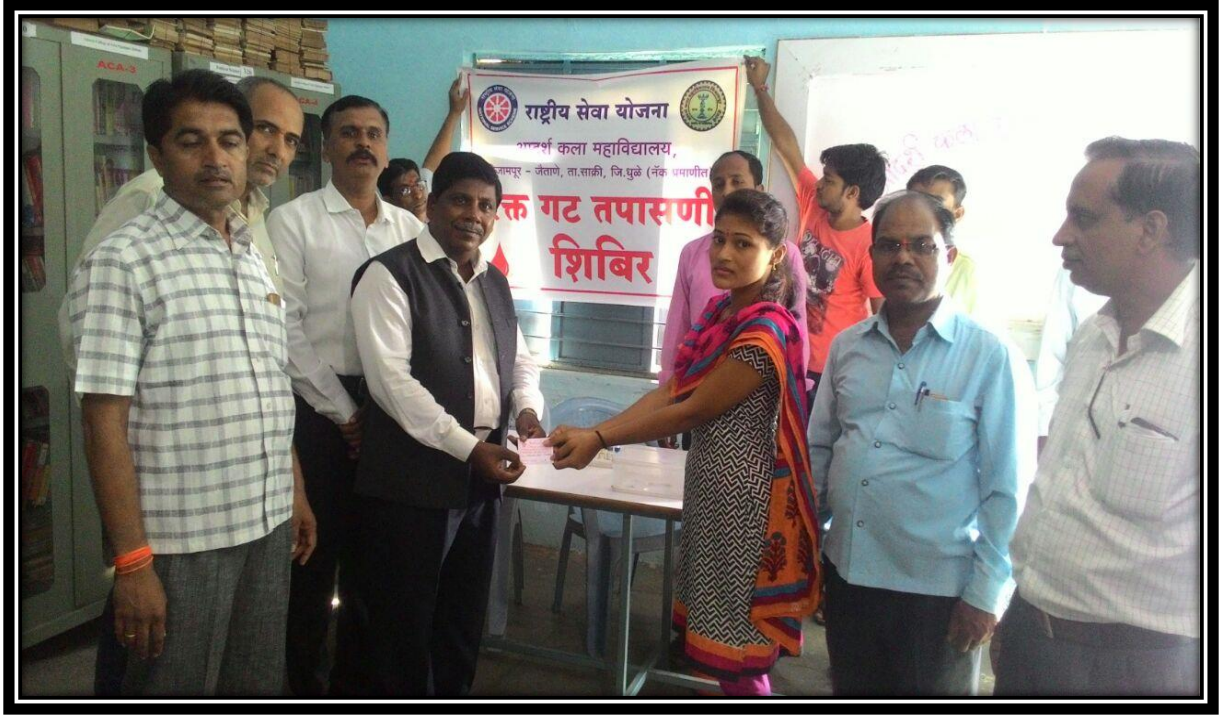
Blood Checking Camp organized in College