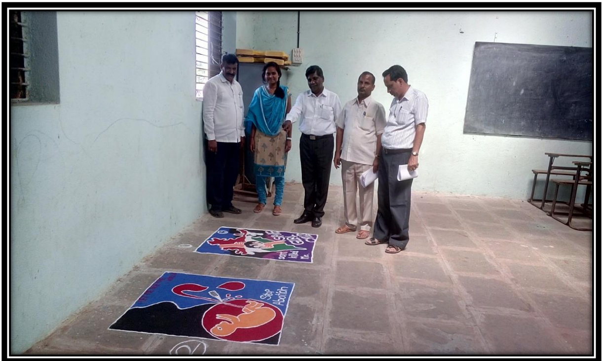
Organized Rangoli Competition on Save Girls Child