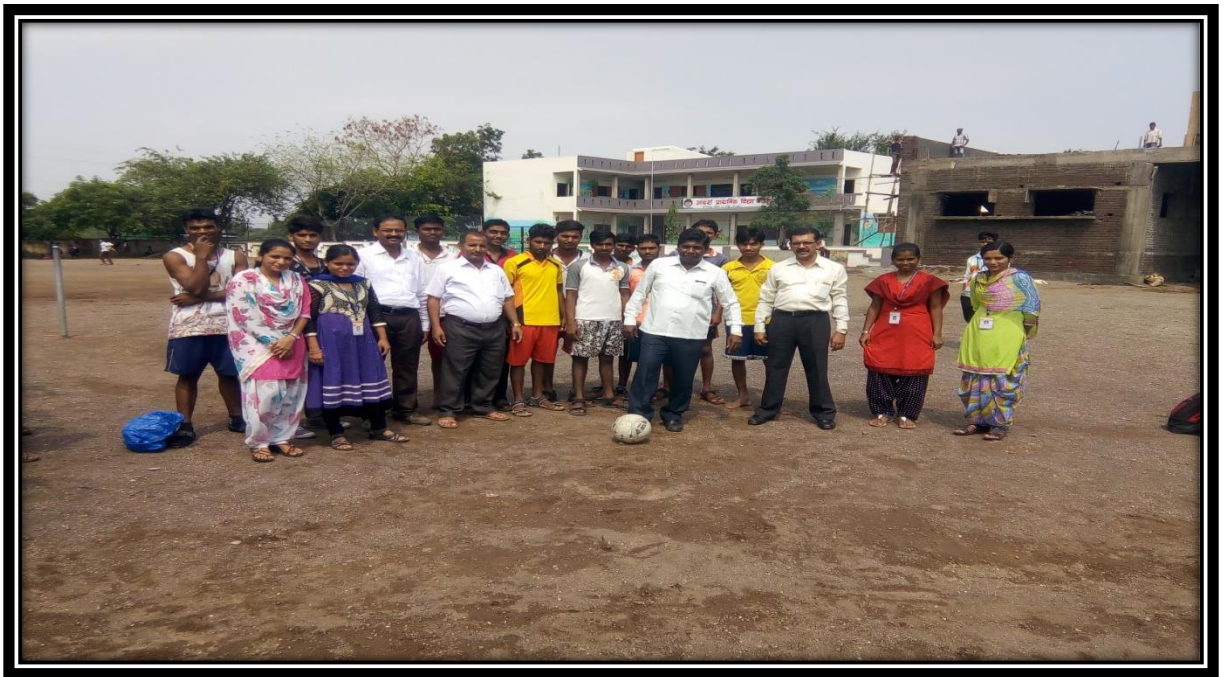
Celebration of Football Day