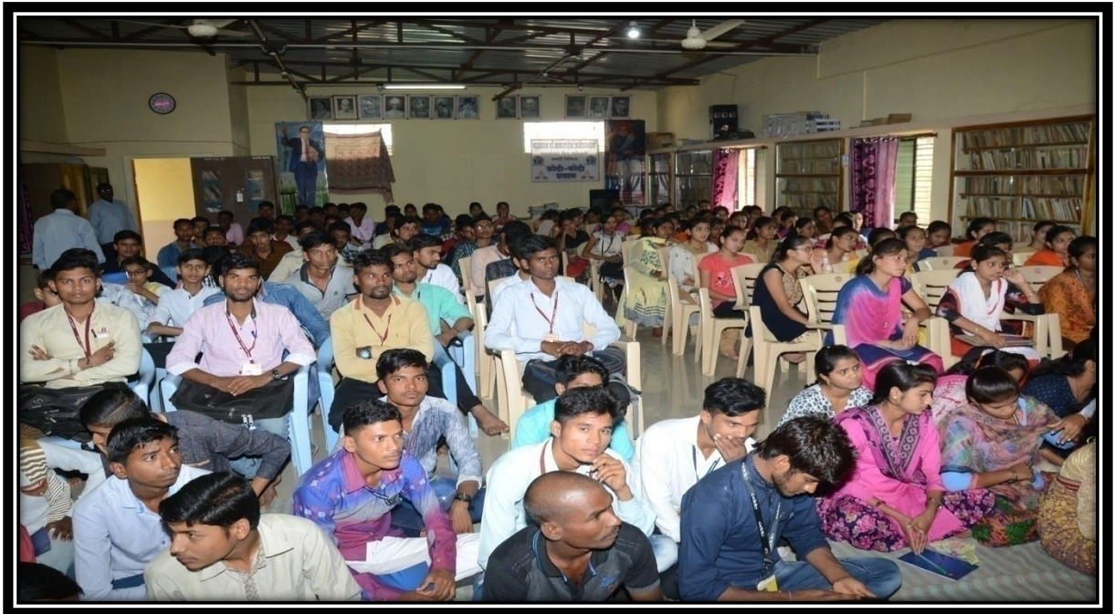
Students are listening the lecture