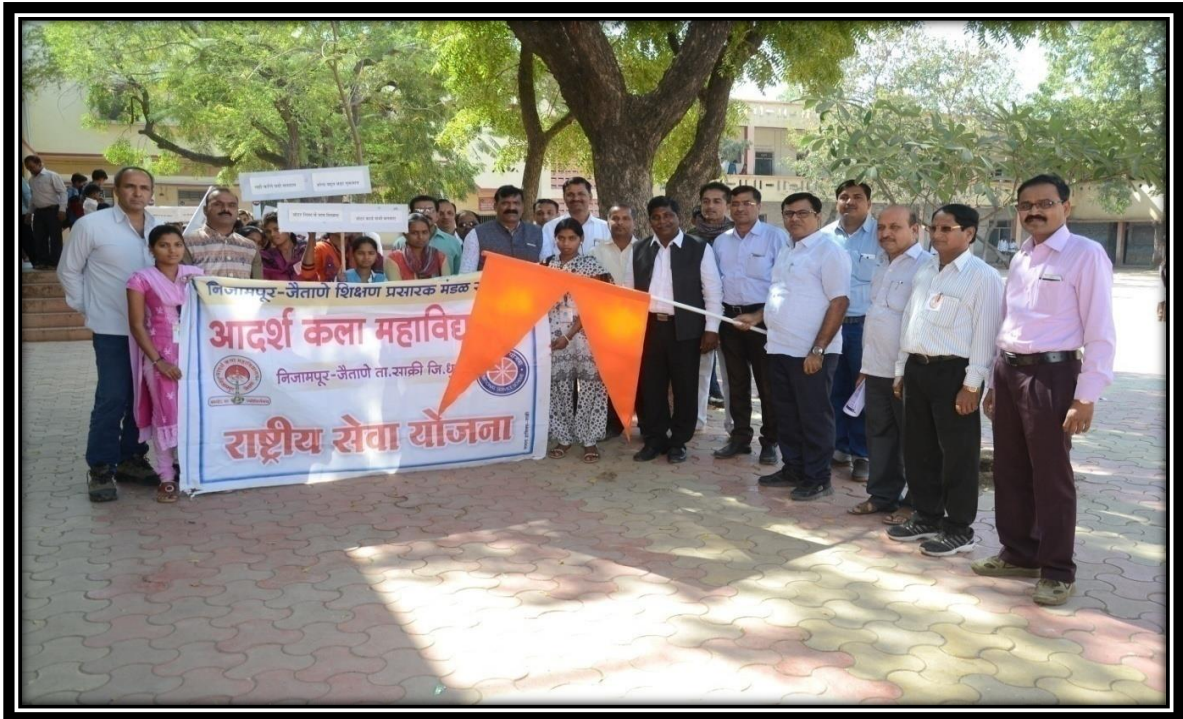
Organized Rally on Beti Bachhav Beti Padav